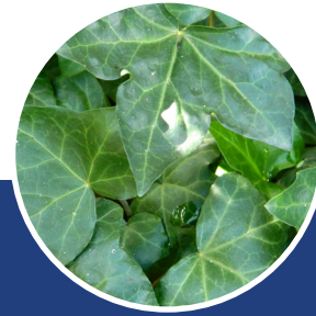
HEDERA HELIX "WOERNER"

Much like a typical 'snowbird' this species can withstand cooler temperatures but prefers the warmth in southern regions. (minimum zone 5)