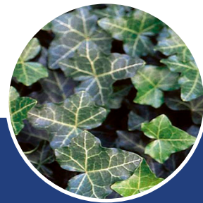
HEDERA HELIX "THORNDALE"

Much like a typical 'snowbird' this species can withstand cooler temperatures but prefers the warmth in southern regions. (minimum zone 5)